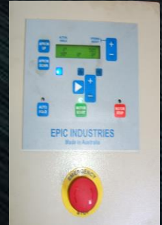
3 Station electronics